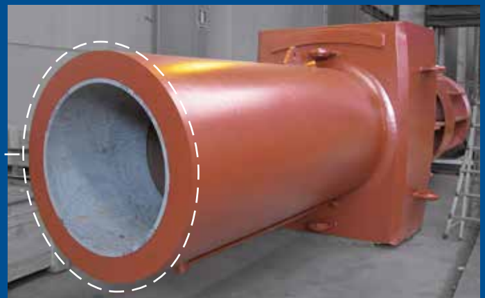
Trunk equipped with BBMS