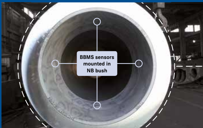
BBMS sensor positions in neck bearing bush